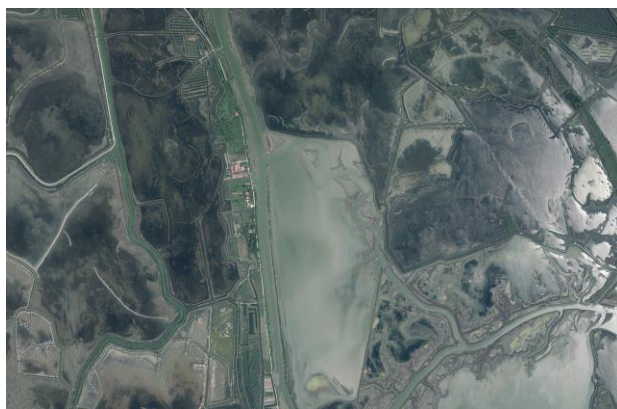
Figure 3. An aerial view of the northern Lagoon of Venice. Coastal wetlands are characterised by particular morphologies, such as salt marshes and mudflats, that thrive in balanced conditions related to water salinity and temperature, wind direction and strength, and the presence and development of hygrophilous vegetation.

The SR presents relict ecological conditions in an almost completely anthropised territory. It currently presents unique floristic characteristics and, above all, from a faunistic point of view, plays a decisive role for migratory avifauna, thus representing a strategic element for the ecological network, even in a vast area.