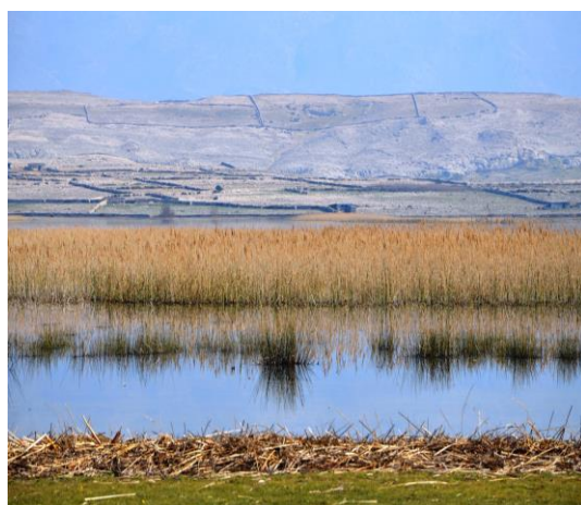
Figure 4. Ornithological Reserve Veliko i Malo blato, Croatia.

For the RP, also characterised by highly variable ecological conditions, the main effort has been to build a community around the wetland area, even before the Contract. The VM's efforts focused on discussing management tools with local communities. In the case of the ND, the aspect of securing and management of unauthorised access within the wetland area was the main critical issue to be addressed during the process (Figure 4).