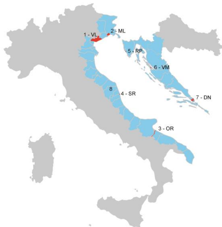
Figure 2. Pilot areas and partners: 1—Università Iuav di Venezia (VL); 2—Comunità Riviera Friulana (ML); 3—Patto Territoriale Nord Barese Ofantino (OR); 4—Comune di San Benedetto del Tronto (SR); 5—Natura Histrica. Public Institution for the Management of Protected Areas in Istria County (RP); 6—Natura Jadera. Public Institution for the Management of Protected Areas in Zadar County (VM); 7—Public Institution for the Management of Protected Natural Areas of Dubrovnik—Neretva County (DN); 8—Università degli Studi di Camerino.

The CREW project partners were carefully selected to include representatives of the main authorities and stakeholders working in the field of environmental protection in Italy and Croatia (Figure 2).