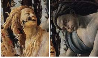
39_11b | Sandro Botticelli, Chloris, detail from Primavera , tempera on table, 1477-1482, Firenze, Uffizi.