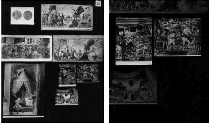
Detail from Mnemosyne Atlas , Panel 30, Warburg Institute Archive, London. 30_5 | Benozzo Gozzoli, Journey of the Three Kings , fresco, 1459-1461, Firenze, Cappella di Palazzo Medici-Riccardi. 30_6 | Benozzo Gozzoli, Giovanni VIII Paleologo as one of the Three Kings, detail, fresco, 1459-1461, Firenze, Cappella di Palazzo Medici-Riccardi.