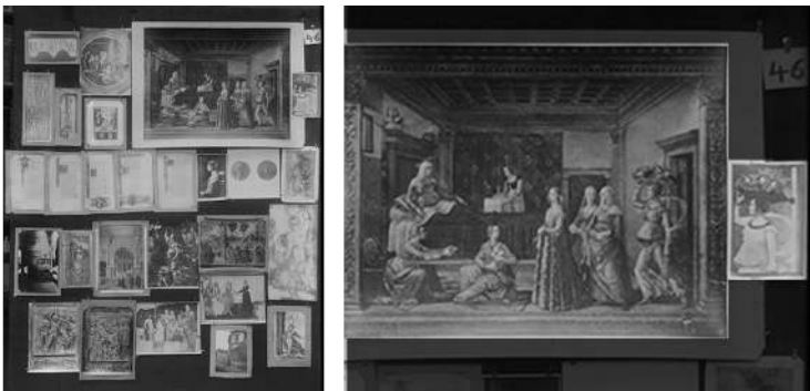
Detail from the Mnemosyne Atlas , Panel 46, Warburg Institute Archive, London. 46_3 | Domenico Ghirlandaio, Birth of Saint John the Baptist , fresco, 1486, Firenze, Chiesa di Santa Maria Novella, Cappella Tornabuoni. 46_7 | Ghirlandaio's workshop, Fruit bearer, copy of the detail from Birth of Saint John the Baptist , Firenze, Chiesa di Santa Maria Novella, Cappella Tornabuoni, Pisa, Museo Civico.

In Panel 46, dedicated to the Nymph and her stride, Warburg focuses on Ghirlandaio's fresco Birth of John the Baptist , drawing our attention to the fruit-bearing maiden who is entering the scene. The figure of this Nymph, entering the fresco from the right side, is taken by Warburg and 'absolutised' in the figure next to it, in Panel 46. It is an image that, at a first glance, might appear to be an extrapolation of Ghirlandaio's canephore, while being in fact a workshop copy of the figure, evidence of the subject's diffusion in autonomous ways (Seminario Mnemosyne 2021, for an English version see Seminario Mnemosyne 2000).