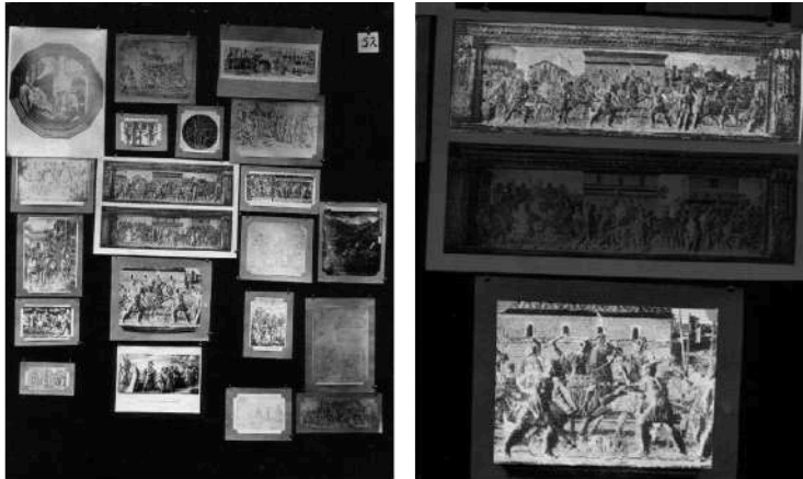
Detail from the Mnemosyne Atlas, Panel 52, 52_11 Cerchia di Andrea Mantegna, Triumph of the Romans over the Dacians, from The Legend of Trajan, stucco bas-relief, Paola Gonzaga's marriage chest, Mantova 1477, Klagenfurt, Museum Rudolfinum. 52_13 | Cerchia di Andrea Mantegna, Trajan's Justice, from The Legend of Trajan, stucco bas-relief, Paola Gonzaga's marriage chest, Mantova 1477, Klagenfurt, Museum Rudolfinum.

Warburg in Panel 52 focuses his attention on Paola Gonzaga's wedding chest by Mantegna's workshop. Underneath the picture of the bas-relief decoration, representing the triumph of the Romans over the Dacians, is affixed a photographic detail of the scene. The image depicted is that of Trajan's Justice, following the legendary tradition whereby the emperor breaks his horse in front of the supplicant mother whose son has been run over by his soldiers. The enlargement isolates the emperor in front of the woman, separating them from the extended scene of the military procession. The inversion of the energetic sense whereby the imperial pathos – represented to the utmost degree by the depiction of the condottiero in the act of “overwhelming by riding” – becomes, using an overlapping pose, the representation of power restrained by Christian