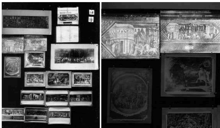
Detail from Mnemosyne Atlas , Panel 28-29, Warburg Institute Archive, London. 28-29_4 | Palio di S. Giovanni, Sellers of antidotes, detail, marriage chest, early fifteenth century, Firenze, Museo Nazionale del Bargello. 28-29_5 | Palio di S. Giovanni, Marriage chest, early fifteenth century, Firenze, Museo Nazionale del Bargello.

In Panel 28-29, whose theme focuses on the daily life represented on chests as a vehicle for the circulation of images and themes from antiquity, Warburg studies the image of a Florentine wedding chest from the early fifteenth century, depicting the Palio di San Giovanni. By ‘zooming’ on its decoration (the photograph of the detail can be seen on the left side to the entire image of the painted chest), the attention is drawn to the scene of the medicine ( triacca ) sellers: the depiction of a “self-regarding society that presents itself, in all its pleasing detail, in the conversational tone of a court balladeer” (Warburg, Renewal , 282).