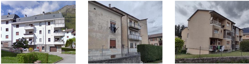
Figure 1. Case studies: main façade of the three monitored social housing buildings in Belluno.

Moreover, tenants' perception of IEQ was asked. In particular the survey aims to highlight the following EP risk factors: