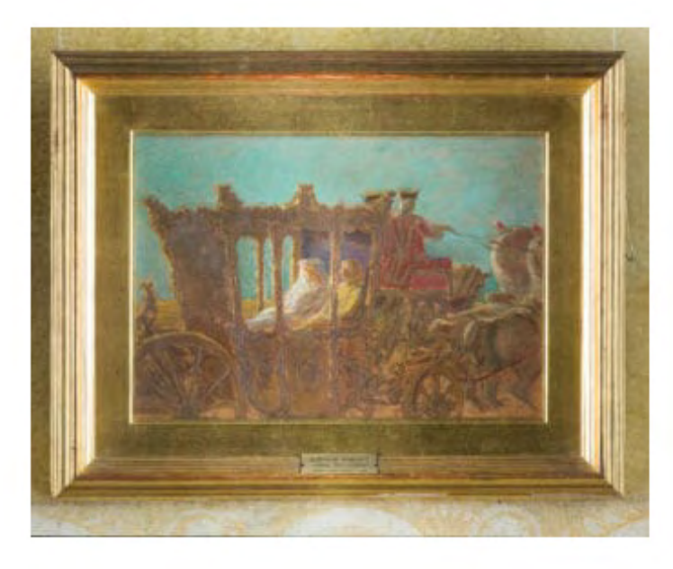
Figure 2. Gaetano Previati, "Viaggio nell'azzurro," 1895. Oil on canvas, 13 9/16 x 19 11/16 in. (34.5 x 50 cm). © Galleria d'Arte Moderna, Milano. Photo credit © Umberto Armiraglio. All rights reserved.

The corpus aimed to give to Italian art its artistic primacy dismissing any foreign influence, especially the French Impressionists and Post-Impressionists, whose paintings were circulating widely in the broader European