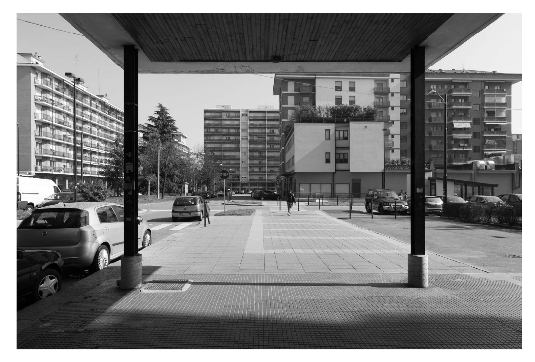
FIGURE 3.6.1 Mirafiori neighborhood, Turin (Italy).