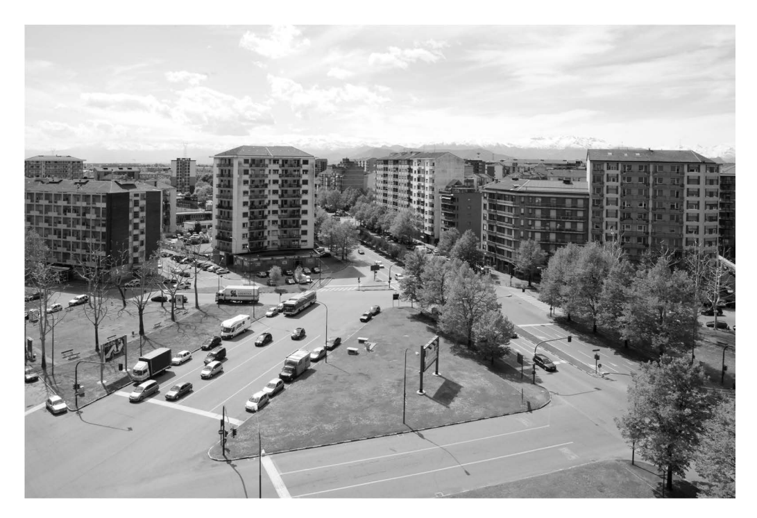
FIGURE 3.6.2 View on Piazza Pitagora, Turin (Italy).