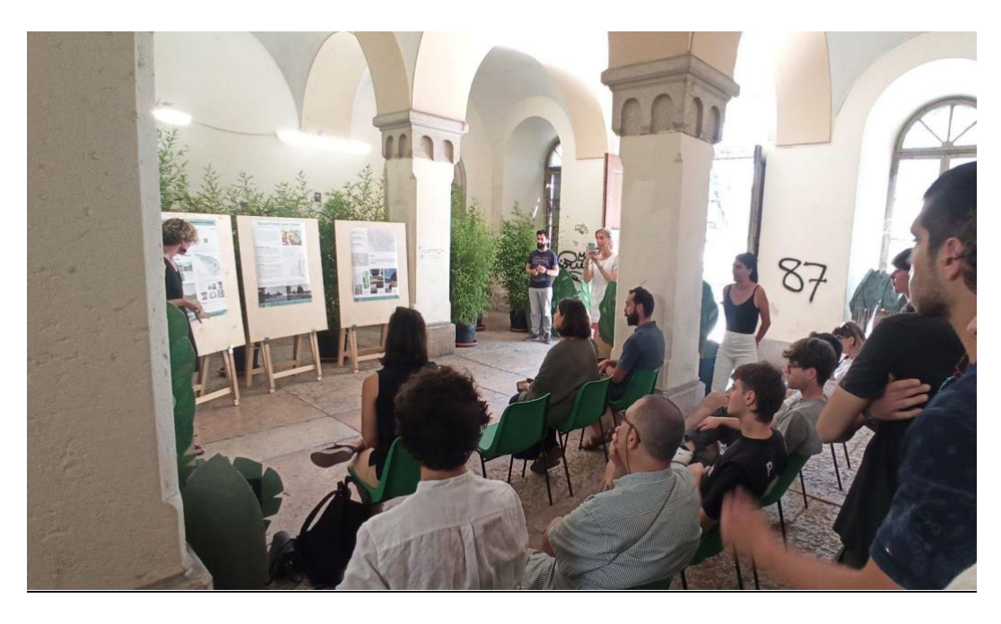
Figure 4| Public presentation of the projects and the photographic exhibition "Let's degrade in the city".