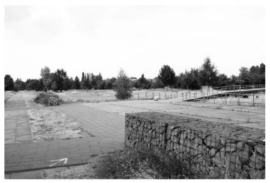
Note: While the park includes a nature reserve and is a biodiversity hotspot for grassland species, a large proportion of the newly planted trees died, despite irrigation, leading to a lack of shadow and cooling capacity.

maintenance of green spaces (Forsa 2014). Between 2012 and 2019, about 44,000 street trees were cut and only about 18,000 planted (BUND 2021). Issues with maintenance even concern relatively new green spaces, partly due to high intensity of use, but also due to climatic conditions, plant diseases, etc. For example, in the landscape park Johannisthal (see Figure 10.5) more than 500 of the 870 planted native trees died within the first ten years. According to the district administration, this is related to the low water storage capacity of the soil, high surface temperatures, and tree species not being adapted to the extreme site conditions. Irrigation, which is not automated, was applied but did not significantly stop the loss of trees and resulted in high costs. Therefore, replanting is not planned (BA Treptow-Köpenick 2018a, 2018b).