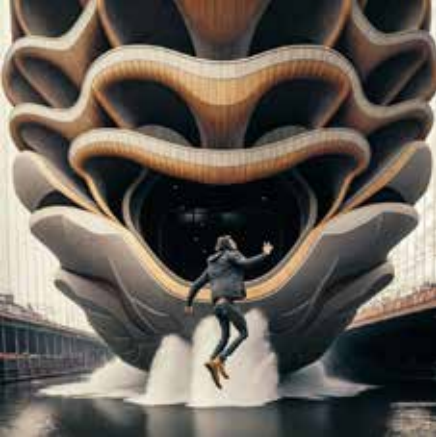
← . Heatherwick's Vessel closes again after fourth suicide. Deezen, August 2, 2021.