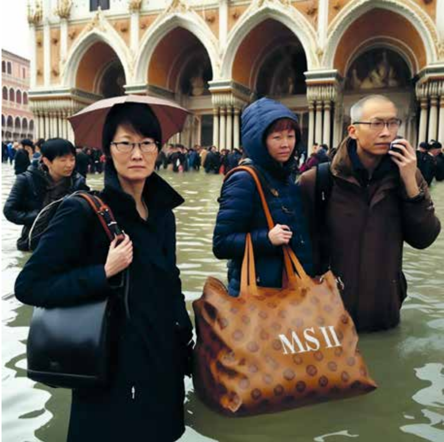
↑ . Humiliated Venice: November 12, the apocalypse of the submerged city. Il Gazzettino , November 12, 2019.