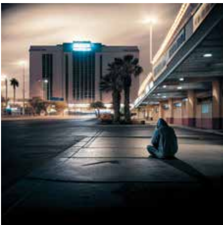
← . Las Vegas places homeless people in a parking lot, 6 feet apart, while casinos are deserted and thousands of hotel rooms are empty. The New York Times , March 31, 2020.