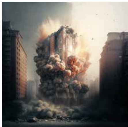
→ . China tears down tower blocks an effort to boost the stalling economy. Beijing has adopted a “build, pause, demolish, repeat” strategy. The Telegraph, August 23, 2022.