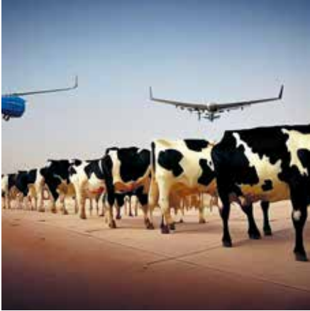
← . Flying cattle class: Qatar to airlift 4,000 cows to break Saudi Arabia-led blockade. Middle East Eye, June 13, 2017.