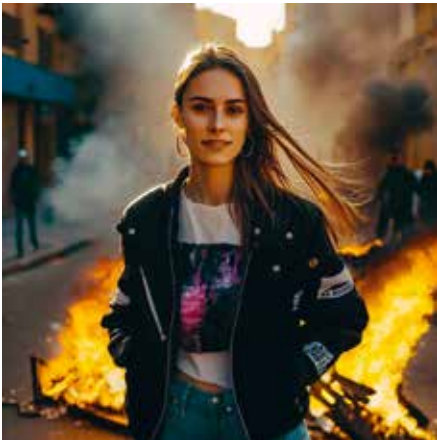
← . Influencer is facing a barrage of criticism for publishing before her 700,000 followers an image that turns the riots in Barcelona into a fashion editorial. El Pais, October 17, 2019.