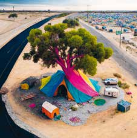
← . Homeless Pacoima man creates a decorative encampment. San Fernando Valley Sun / El Sol, June 23, 2021.