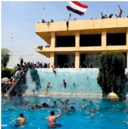
← . Dozens of protesters jump in the swimming pool of the Presidential Palace in Baghdad to face Iraq's hot weather. Iraqi News, August 29, 2022.