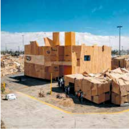
← . Amazon will open a $21 million state-of-the-art warehouse in Tijuana, Mexico, that abuts a housing settlement made of cardboard, tarp, and wood scraps. Vice News , September 7, 2021.