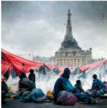
← . Hundreds of migrants, mostly Afghans, were brutally expelled from Place de la République in Paris. Le Monde , November 24, 2020.