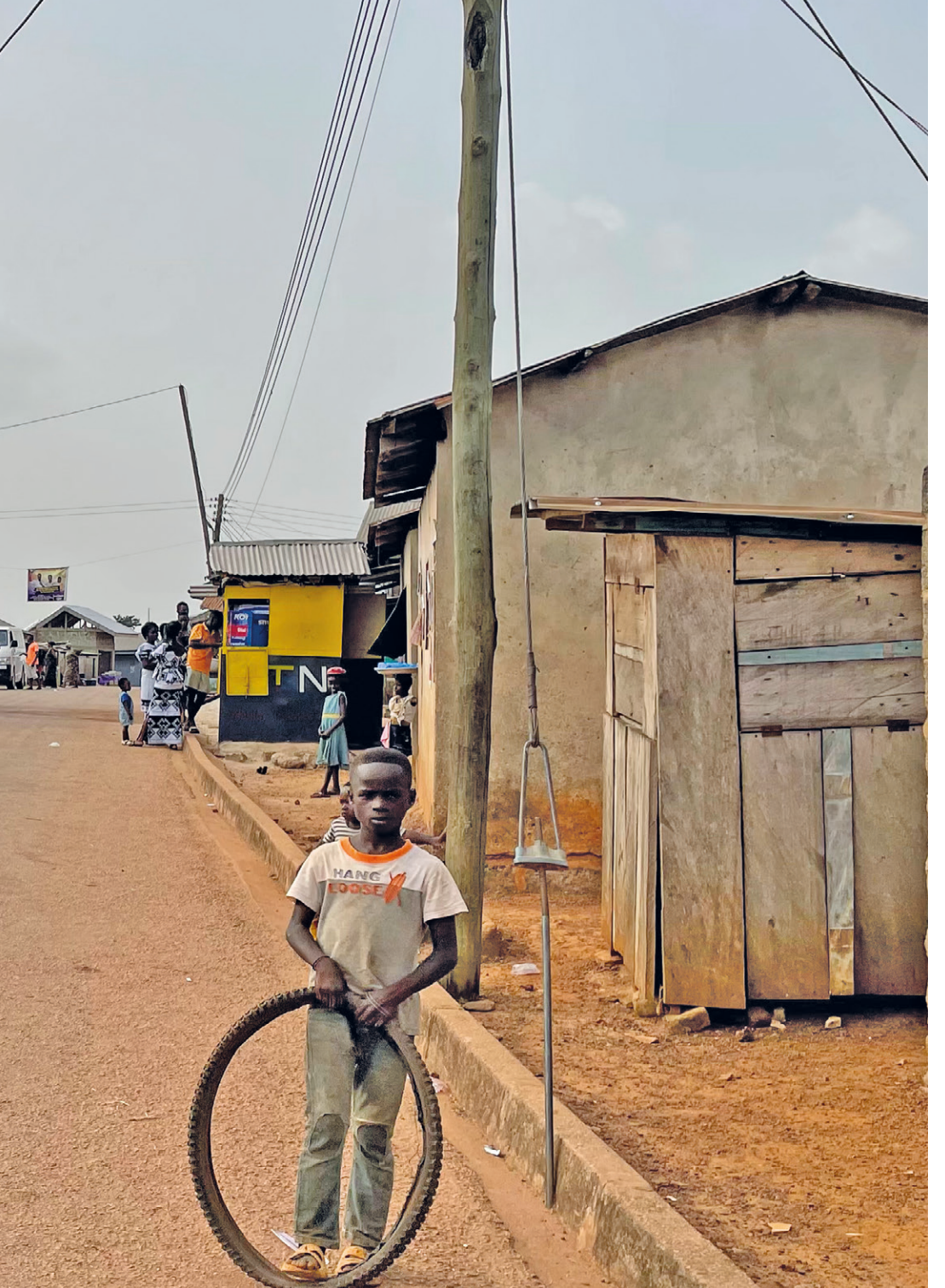
Ghana, Aboduam, the main street of the village that leads to the project area.