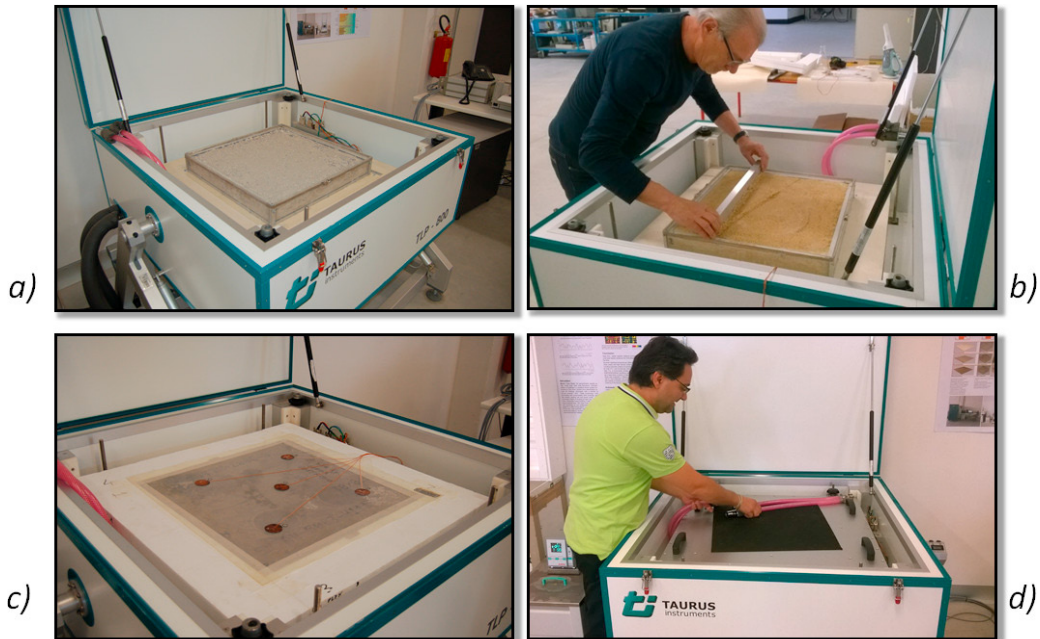
Fig.2. Several phases of thermal measurements on gravel samples by using the proposed device. a - b) The gravel sample is inserted into the box; c) After closing the box cover, the thermal sensors are installed; d) The refrigerant system is positioned in order to maintain the imposed temperature in the cold plate.

In figure 2 some phases of the proposed methodology are depicted.