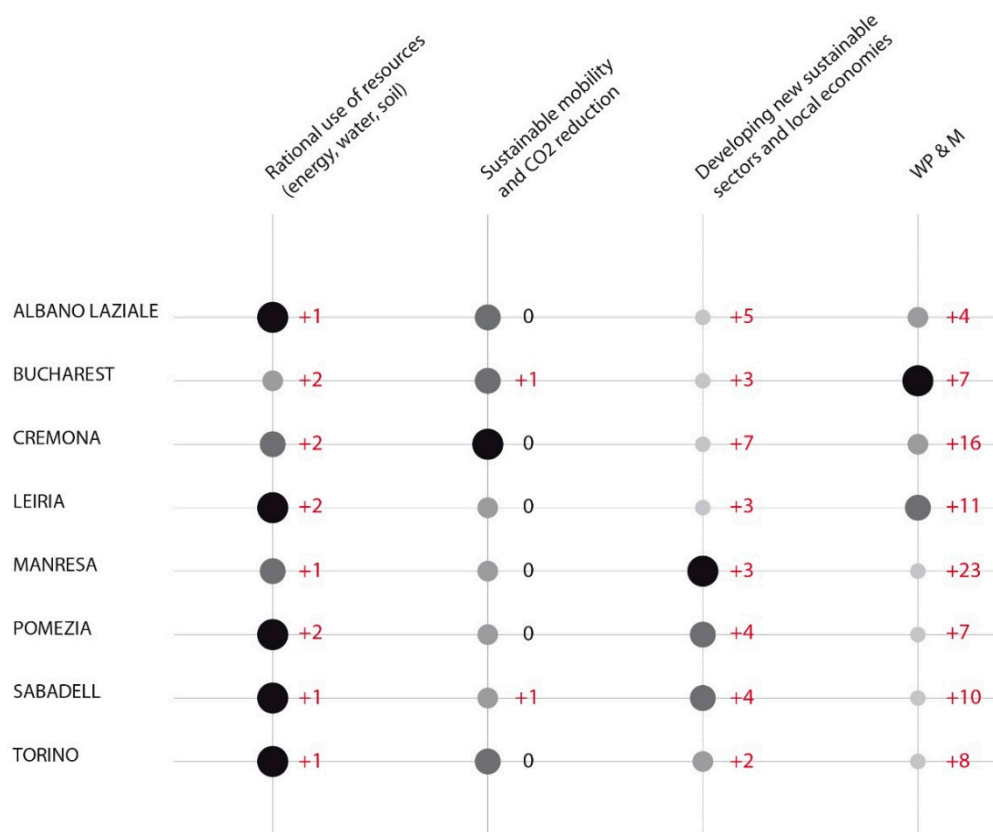
Figure 3. Classification of (i) the existing measures implemented or allocated within the current policies in the eight pilot cities that have an effect on resource consumption and waste production, and (ii) the new planned measures defined within the strategic plans, according to the four main categories identified: rational use of resources—energy, soil, and water; sustainable mobility and CO 2 reduction; development of new sustainable sectors and local economies; and waste prevention and management. Circles represent an approximate proportion of the existing measures classified by the four categories. The bigger and darker is the circle, the greater is the number of the existing measures related to that category. Alongside the circles, numbers represent the number (as an increased quantity) of the new planned measures defined within the strategic plans.

Figure 3 shows, for each one of the pilot cities, both the existing measures implemented or allocated within the current policies (see also Table 1) and the new planned measures defined within the eight strategic plans. This allows a visual and immediate comparison of the relevance (in terms of magnitude and number) between the existing and the new planned measures and actions. It helps to understand how (i.e., in which sectors and with which relevance) the strategic plans developed within the Urban_WINS project could contribute/reinforce the city strategy on waste prevention and resource management.