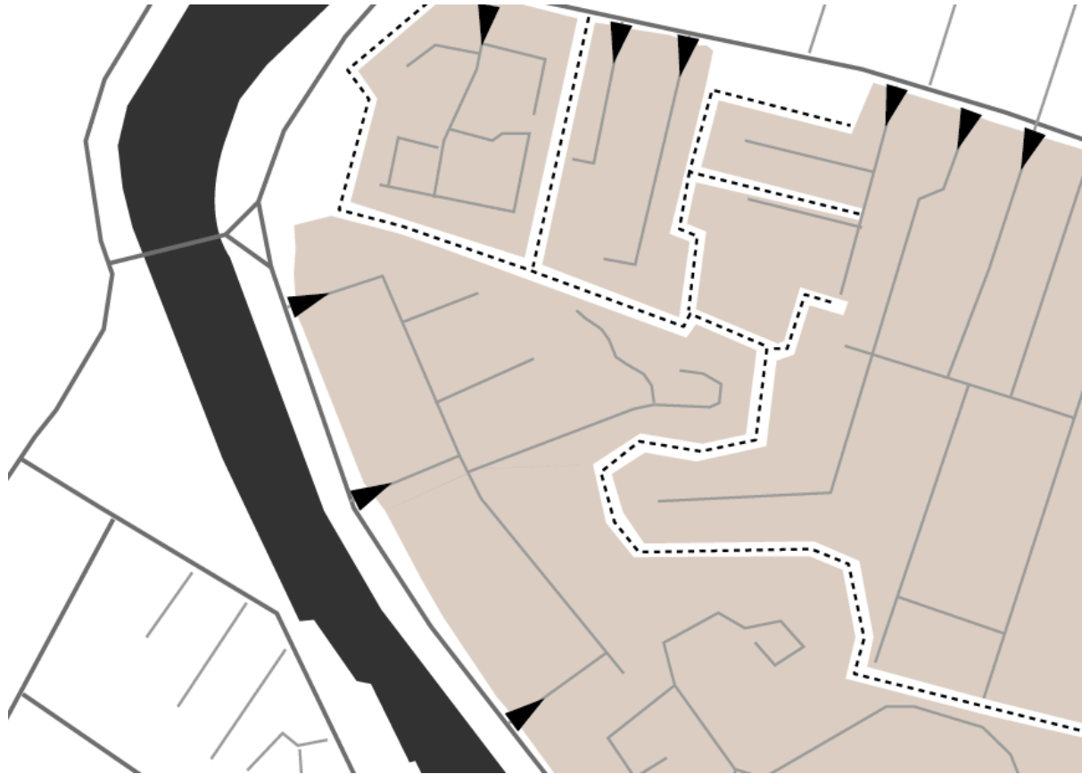
Detail of a residential area in southeast Belfast. The dashed black line shows the invisible borders between residential blocks and frames the dead-end streets.

As a matter of fact, from the 1960s to the end of the millennium, street connections reduced and mobility was limited through the formation of the culs de sac. Moving from a specific spot of the city to another became more and more difficult. Distances increased while neighborhoods gradually established their individualistic character, which followed an “appropriation”, thus a “semi-public” use of the residential courts. The inner city is currently the only permeable urban area, although it is also, paradoxically, the most depopulated one (Plöger 2007).