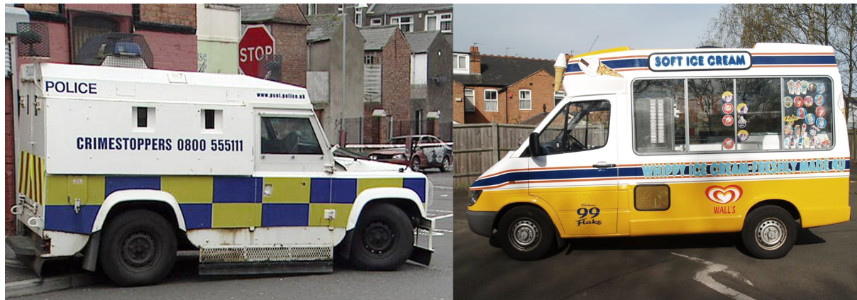
Police van compared to ice cream van

In addition, perhaps it is not a coincidence that police vans were redesigned to a particularly ice cream truck-like construction in 2001, right after the NI police force transitioned from the Royal Ulster Constabulary to the Police Service of Northern Ireland as a result of the Good Friday Agreement (United Nations 1998).