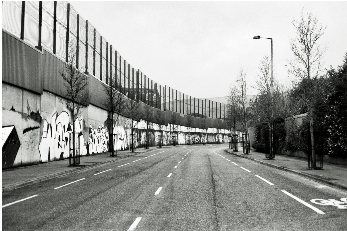
Peace wall in West Belfast, 2015

Based on the field analysis and the interviews in this study, it is possible to conclude that ice cream van routes rarely touch middle- and upper-class residential areas. The sonic identity created by ice cream melodies within working-class residential areas reveals a strong connection between borders, isolated residential courts, and difficult-to-access neighborhoods. Once or twice a day the ice cream vans establish a symbolic “bridge” between the city and the marginal and segregated areas. This is relevant especially for those who rarely leave their neighborhoods (i.e. stay-at-home parents and children as well as elderly people).