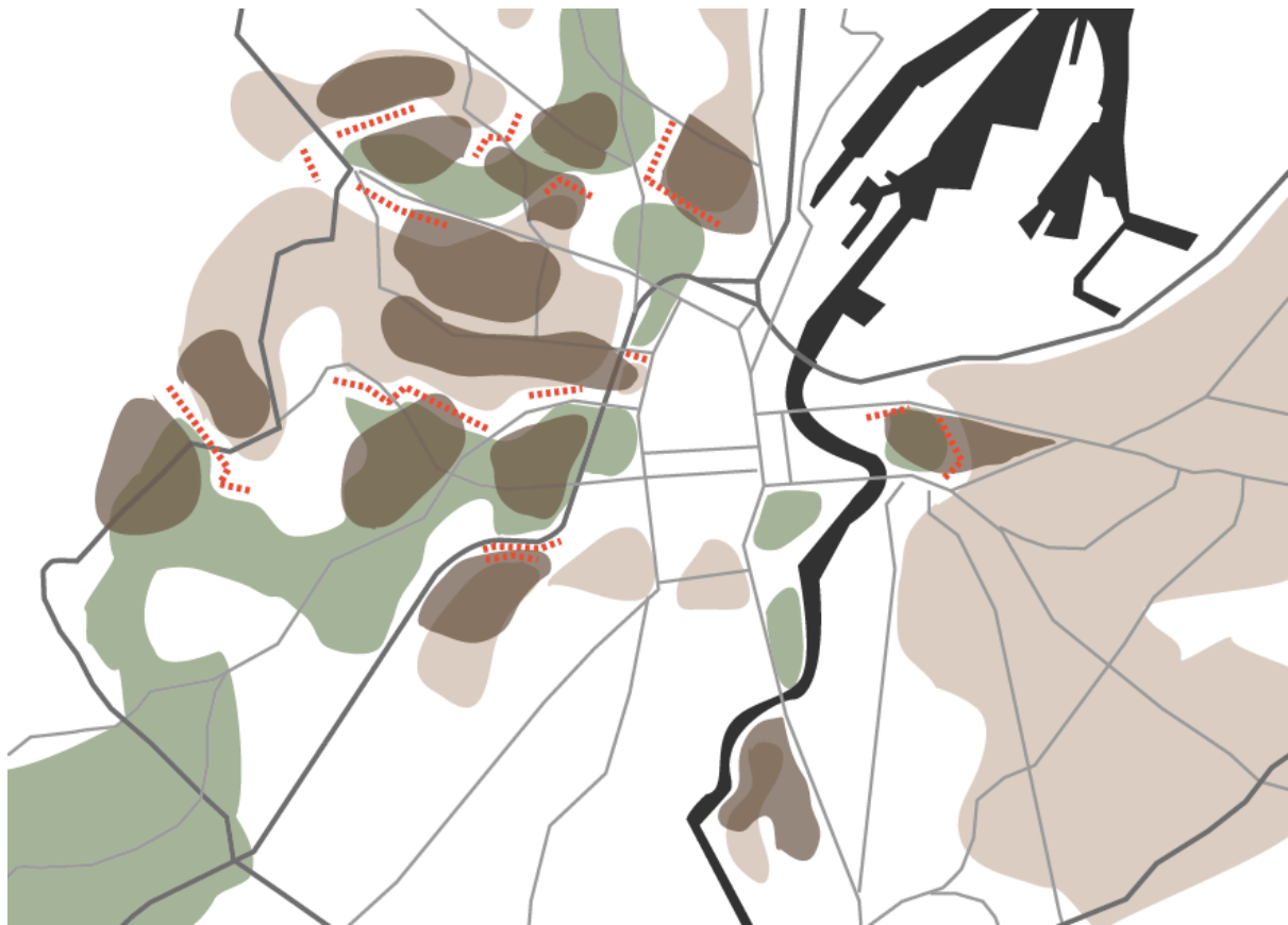
Ice cream vans areas of activity (brown) extracted by the fieldwork

Despite the long cold seasons, ice cream vans represent a surprisingly widespread mobile trade which enjoys considerable success in these areas. From a sonic perspective, the melodies broadcasted by ice cream vans seem to be one of the few sonic signals able to break down the segregation framework. Indeed, their melodies are easily recognizable on one side or the other of a peace wall as well as within one courtyard or the other, even though residential courts are often impermeable to each other (Augoyard and Torgue 2006).