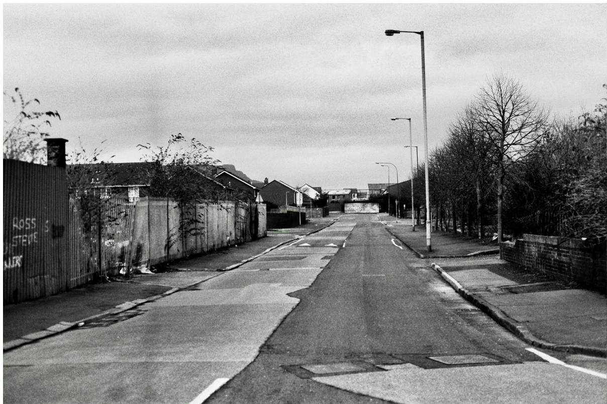
Dead end street in West Belfast, 2015 – Photo: Nicola Di Croce

Sound has the potential to orient the inquiry and drive strategic planning priorities; a shared acknowledgment of the sonic identities experienced within segregated communities can encourage marginal areas inhabitants to reach beyond their limits toward a "sweet" resolution.