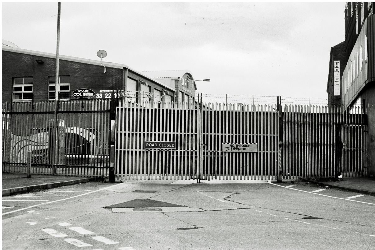
Closed road in West Belfast, 2015

Moreover, by listening to everyday sounds, it is possible to inquire into public space uses and abuses (de Certeau 1990), conflicts and resolutions, as well as acoustic characteristics, peculiar sonic identities, and cultural heritages. All these elements are crucial for the investigation of a specific context, especially with regards to understanding segregated areas. The sonic environment of Belfast's most segregated areas is studied here as a "bridge" to investigating anthropic traces (Dewey 1938), symptoms suggesting urban issues to be further examined (Thibaud 2003). This is particularly interesting when the inaccessibility displayed by the urban form prevents an accurate investigation of the urban environment.