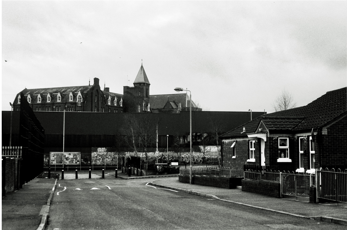
Peace wall in West Belfast, 2015

Therefore, listening to lower-income neighborhoods represents a challenge that connects sonic studies with urban planning and public policy design: What does urban segregation sound like? How can a sonic understanding of this issue stimulate a reframing of policy? These are the central questions this paper approaches through a case study of the Belfast urban environment.