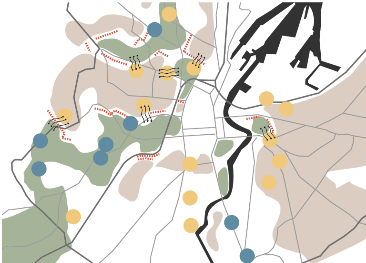
Areas with the highest concentration of street trade licenses (blue) and the border areas where new licenses could be activated (yellow). For this sonic proposition, I have indicated the most accessible borders with arrows.

The present research posits that the reconnection of Belfast’s fragmented neighborhoods can be stimulated through a sonic approach. For this to happen, however, cooperation between Planning and License Offices is essential.