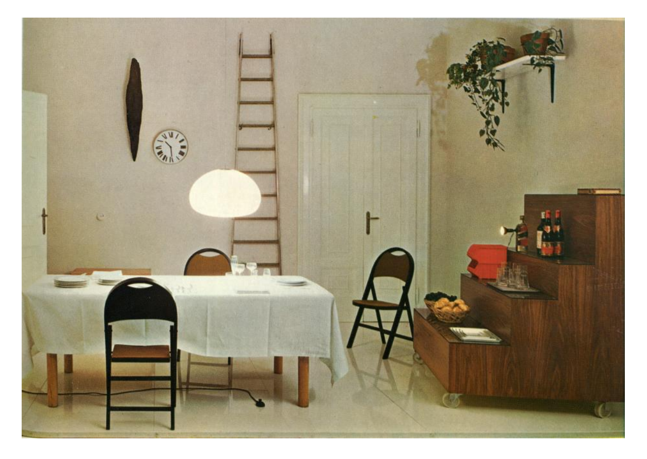
Fig. 4. Achille and Pier Giacomo Castiglioni, Room of the exhibition, La casa abitata (The Inhabited House) , Florence, Palazzo Strozzi, 1965, Fondazione Archivio Castiglioni, Milan

The apparent straightforwardness of the two parallel paths (architectdesigners and designer-designers), could not but be affected by the conditions created by the rapid growth in production and consumption, enabled by the low cost of labour: an increase in exports on the one hand, and warning signs of growing social tensions on the other. If one also considers how hard it was for young architects to break into their profession due to mass university schooling, or the new ideas deriving from the counterculture<sup>55</sup> and the introduction of the Beat Generation<sup>56</sup> artists and poets in Italy, it becomes obvious how the clarity of cultural instruments and methods that the separate disciplines of architecture and design considered to be shared and usable, in fact raises several issues of concern.