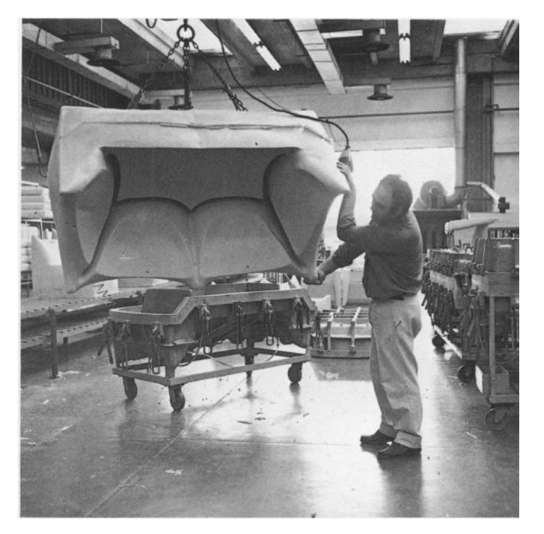
Fig. 8. Production of the Bambole sofa (Mario Bellini, 1972), B&B Italia, B&B Archives, Cantù (Como)

C&B, later to become B&B Italia, was also conceived as an industry: it was founded in 1966 in Brianza to develop Cesare Cassina and Piero Busnelli's idea for perfecting machines to cold-form polyurethane foam [FIG. 8]. This technology allowed designers such as the Afra and Tobia Scarpa, Mario Bellini or Gaetano Pesce to work at the Research and Development Centre on concepts for upholstered seating in a myriad of forms, devoid of rigid structural supports, made to accommodate the new attitudes arising in home living<sup>89</sup>.