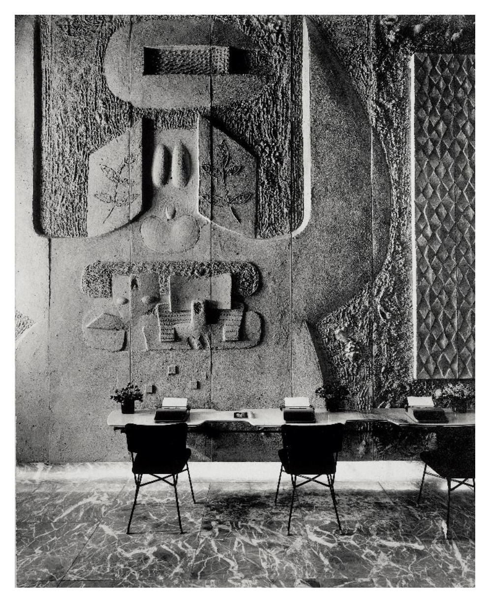
Fig. 3. BBPR, Olivetti Showroom in New York with relief by Costantino Nivola, 1954

important exhibitions: the international exhibition of modern architecture organised by Alvar Aalto, Pier Luigi Nervi, Nikolaus Pevsner, Giulio Carlo Argan and Luigi Moretti, and the international exhibition of industrial design curated by Zanuso, Rosselli, Gillo Dorfles and Leonardo Ricci, in addition to the customary housing exhibition in the pavilions of the park. In each of them, despite the ubiquitous participation of architects, the different design sectors were becoming increasingly distinct; their separation from the applied arts was clear-cut, giving rise to an extremely varied scenario<sup>40</sup>. The idea of industrial design in close collaboration with manufacturers appears consolidated in all the exhibitions of the time<sup>41</sup>, but many architects who were entering the profession in the 1950s and gravitated around the editorial offices of Casabella-Continuità returned to the theme of continuity with tradition in the field of design as well, opening them up to Reyner Banham's criticism of the 'infantile regression' of some Italian architecture<sup>42</sup>.