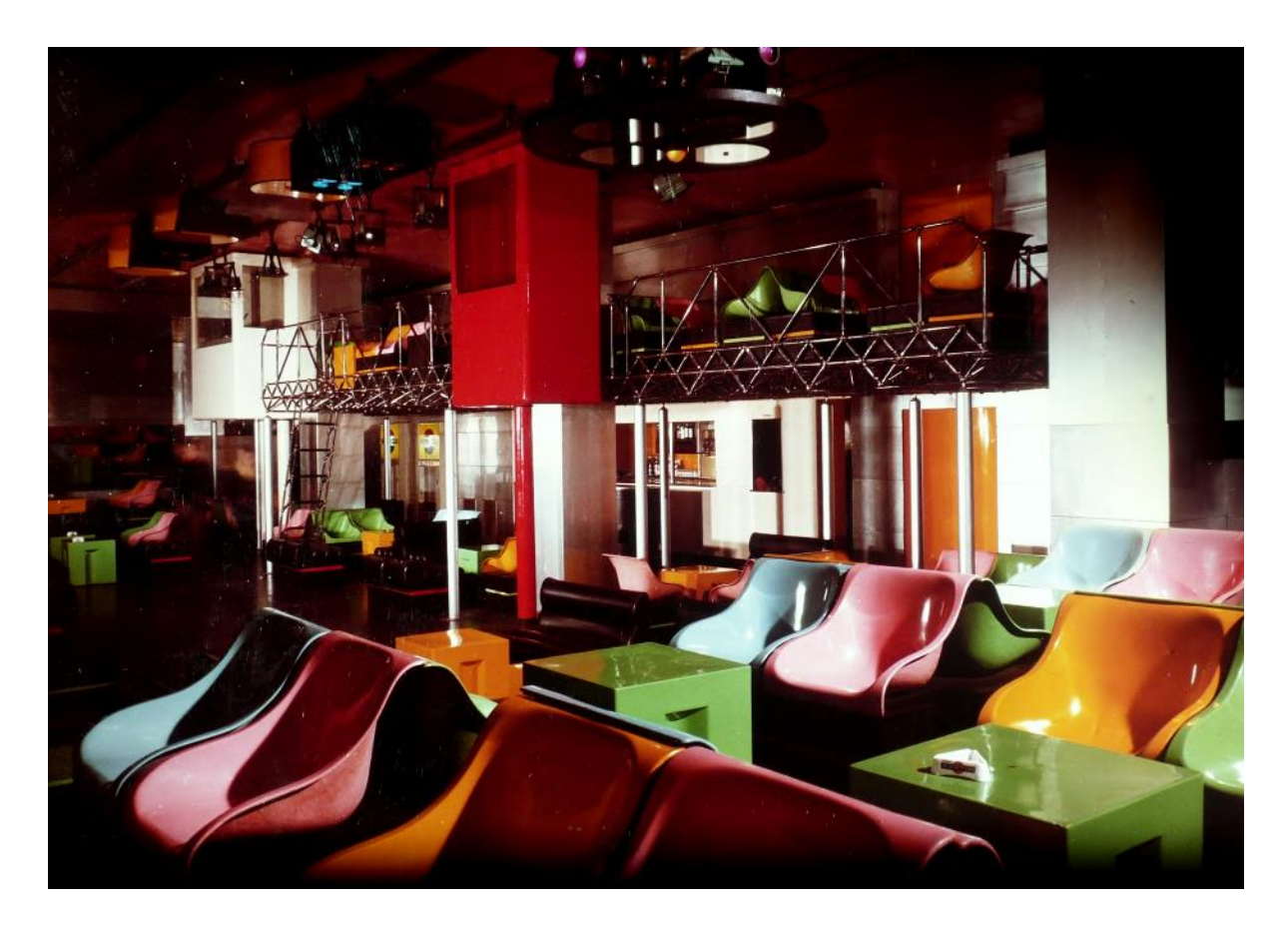
Fig. 5. Piero Derossi, Interior of the Piper nightclub, Turin, 1965

Superarchitettura (1966), the Piper nightclubs in Rome, Florence and Turin (from 1965 to 1967) [Fig. 5] or the Effimeri urbanistici by UFO (1968), not only featured objects and equipment inspired by the Pop culture that reflected new ways of living in homes and cities, they also laid the foundations for a challenge to the acclaimed relationship between design and the industrial system. The pillar of this new hybrid between architecture and design were the experimental companies located outside the mainstream industrialised sphere of the Lombard region. They embraced ideological positions on themes that challenged codified design approaches, the capitalist industrial system and the re-assessment of the craft industry, as well as the individual and emotional value of design, positions taken by many architects in the face of situations such as Global Tools<sup>57</sup>.