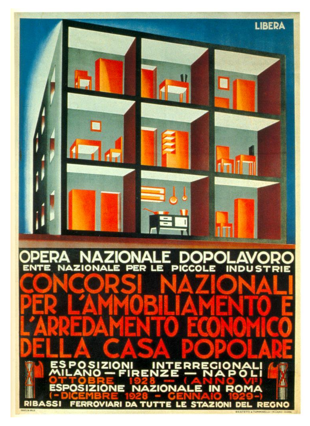
Fig. 1. Adalberto Libera, Poster for the Exhibition of the Results of the National Competitions for the Economic Furnishing , 1928, Private collection

of the 1936 and 1940 exhibitions in Milan<sup>23</sup>. On display were objects for domestic use, as well as engines, optical instruments and calculation devices, objects made of rubber<sup>24</sup>. If on the one hand, the debate surrounding design for mass production in the field of home furnishings, construction materials and processes had achieved full maturity in exhibitions, magazines and schools, there was a persisting degree of vagueness in the understanding of industry and design, in the relationship with the craft industry and other expressions of art and ideologies<sup>25</sup> at a time in Italian history characterized by strong contradictions that would culminate in Italy going to war shortly after the opening of the 7th Triennale.