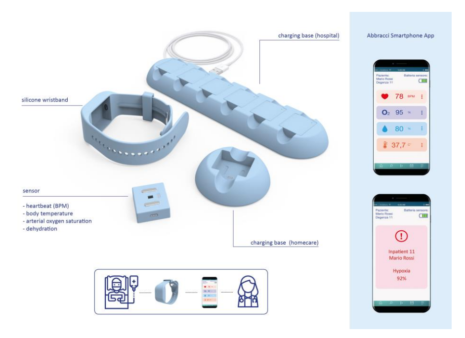
Figure 1. The ABBRACCI kit and the doctor version smartphone App

The role of family doctors has gained a renovated attention as well. Since their duties have much increased, they had to deal with new forms of stress caused also from the lack of protection. Although some academics point out that