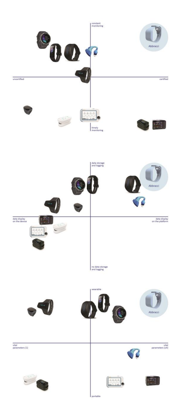
Figure 4. ABBRACCI vs Competitors