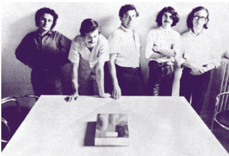
Superstudio: Magic Box. Design Quarterly 78/79 (1970).