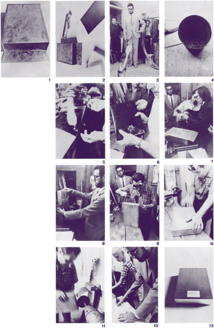
FIGURE 3 Superstudio: photographic sequence of the hiding process. Design Quarterly 78/79 (1970).