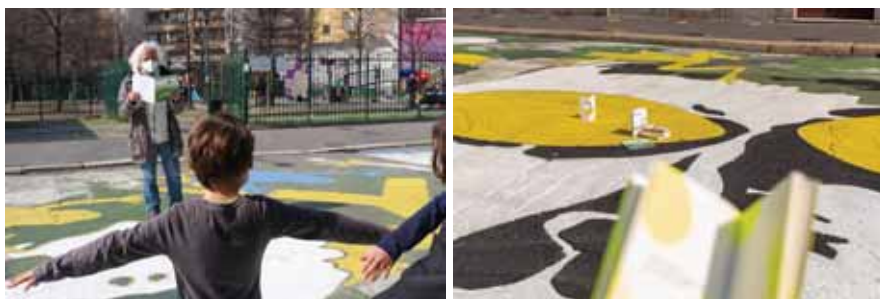
Fig. 2.7 - The new “tactical square” of via Toce during the inauguration, with games and readings with the children of the neighborhood.

Additionally, we intend to implement the proposal shortly by also including some urban devices that could fully belong to that post-anthropocentric vision that was already mentioned above. The neighborhood, in fact, has decided to focus on biodiversity, starting with the “biodiversity of the small”: that of small urban green spaces like gardens, vegetable gardens, but also terraces and balconies; on the other hand, it should not be forgotten that Isola is an area full of parks and has long developed a very strong sensitivity on the issue (think for example of the successful project of the “Library of Trees”). In line with this vision, bug-hotels, shelters for useful insects, kits for urban beekeeping and tools that can encourage this ecosystem approach will be installed in Via Toce to complete the urban furniture that will be provided in the two gardens. The aim is to protect and encourage the variety of living forms and urban environments, enhancing diversity within species, between species and of ecosystems and – again acting on the minute, residual and “peripheral” – committing to the general maintenance of the ecological balance.