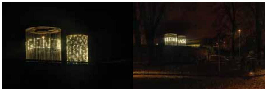
Fig. 2.9 - The “Illumina-Mi” lighting installation installed in Milan at La Ribalta brewery and at the Headquarters of Municipality 9, between December 2020 and January 2021.

All the cases mentioned here, despite the heterogeneity of the approaches and results achieved, ultimately pursued a common goal: