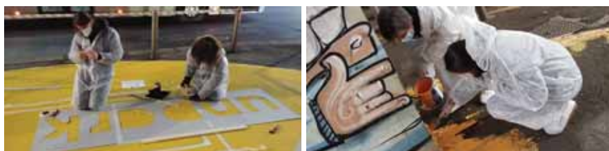
Fig. 2.1 - Work in progress phases of the redevelopment works of the Serra-Monte Ceneri underpass on the pop-up event realized for the call “Furnish”: application of stencils and floor painting. Milan, 4-6 dec. 2020.

In addition, the project envisaged an air monitoring system and the modelling of the data collected by means of control units positioned on the balconies of private homes, to raise citizens’ awareness on Nature Based Solutions environmental protection issues. In conclusion, the implementation and management phases of the pilot project will once again see a strong element of direct participation by the inhabitants, called to “build” and then take care of their living environment as the first co-artisans.