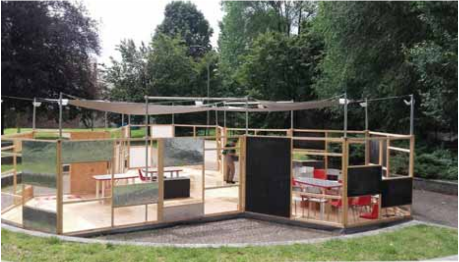
Fig. 2.6 - The Adaptable Self-Managed Travelling Pavilion in its final configuration, during the opening on May 8 th , 2016 in Savarino Park.