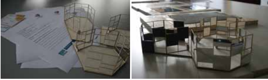
Fig. 2.5 - Study maquettes for the PAAL, representing the different project advancements, presented at the co-design tables on November 28 th and December 10 th , 2015.