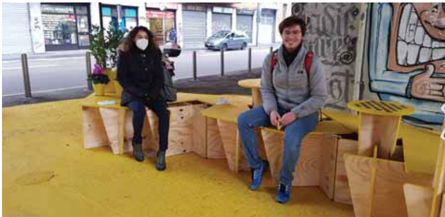
Fig. 2.3 - On-site installation of the MUE:SLI prototypes, funded by the European call for proposals “Furnish”. Milan, 4-6 dec. 2020.