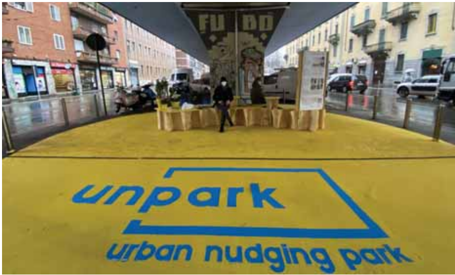
Fig. 2.2 - Redevelopment project of the Serra-Monte Ceneri underpass on the occasion of the pop-up event realized for the “Furnish” call for proposals: in the foreground the graphic area on the floor, in the background the MUE:SLI prototypes. Milan, 4-6 dec. 2020.