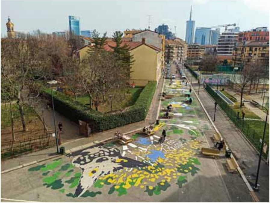
Fig. 2.8 - Overall view of the part of Via Toce between the Bruno Munari Gardens and the small gardens of Via Cusio, redeveloped with a strong graphic-narrative imprint. In the foreground, the wolf from “Little Green Riding Hood”.