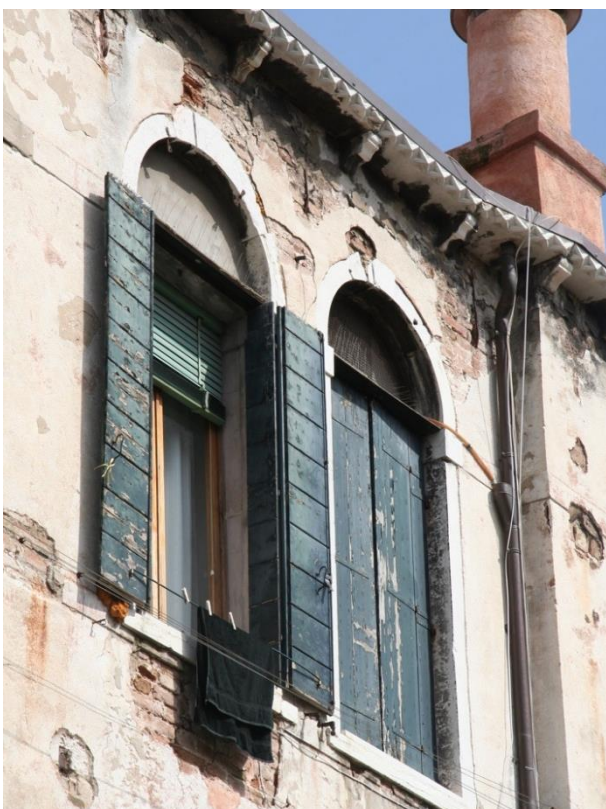
Figure 1. Windows of a historical building visible from a field of wells in the Castello district.

Antique finishes, historical or traditional plasters must be preserved where possible; they must be replaced with mortar and components similar to the initial ones or in any case consistent with the nature of the building's facade, and using techniques typical of the context of the Historic Old Town, in use before the industrialization of lime and cement. In general, the thickness of the new plaster and its texture must be consistent with the characteristics of the masonry and of the elements present on the building front such as the frames of openings, stone or wooden inserts, etc., so as not to impair their legibility by making them too protruding or too recessed with respect to the plaster surface (Municipality of Venice, 2020).