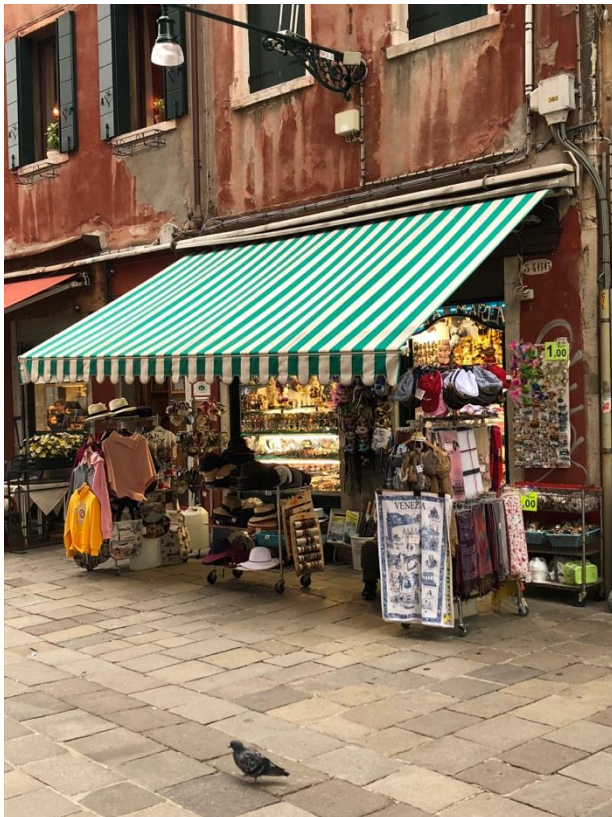
Figure 3. Shop in San Marco district. It is observed the occupation of public land with merchandise and the hanging of goods outside the shop windows.

In particular, natural deterioration, to which it is also possible to attribute positive aspects, albeit in part, (in reference to the debate on surface cleaning, which should not be radical, or the preservation of oxalate patinas) is in contrast with entirely negative degradation phenomena from all perspective, due to lack of care but also to incongruous building interventions induced by changes in use or social adaptations. In this context, the idea of a research project that could hold together all these elements - and others - and also indicate the objective ways of identifying the risk for the conservation of the site, defining, in a word, the degree of 'wear' in the complex system of the city, and its physical and social meaning. (...)