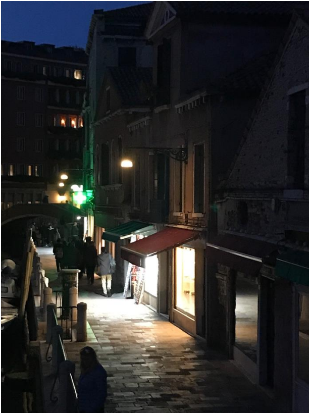
Figure 4. Shop in Santa Croce sestiere with very intense lighting compared to the context (D. Perissinotto, 2019).

As for other institutional activities related to the Site, the Superintendence in cooperation with the Municipality of Venice, is also working on the issue of commercial activities in culturally important areas and buildings, as per art. 52 of Legislative Decree no. 42 of 22 January 2004 (Cultural Heritage Code). The people who have dealt in particular with this theme, besides the author, are T. Favaro, A. Chiarelli and I. Cavaggioni.