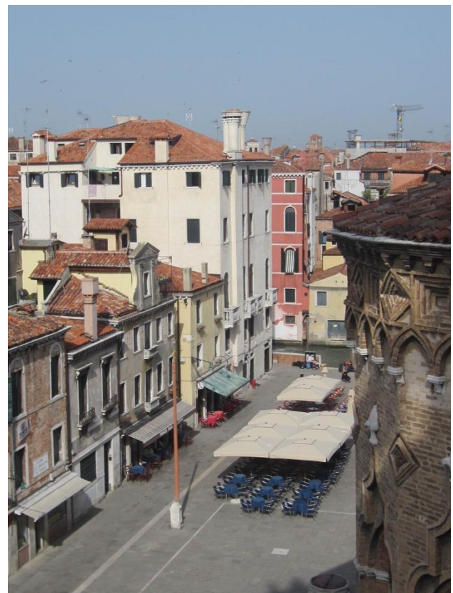
Figure 5. View from above of Campo San Giovanni e Paolo with seating and tables for bars and restaurants.

As part of the activities carried out in collaboration with the Municipality of Venice, a reorganisation and redevelopment plan for the Rialto market area was launched at the end of the 1990s and was completed in 2017.