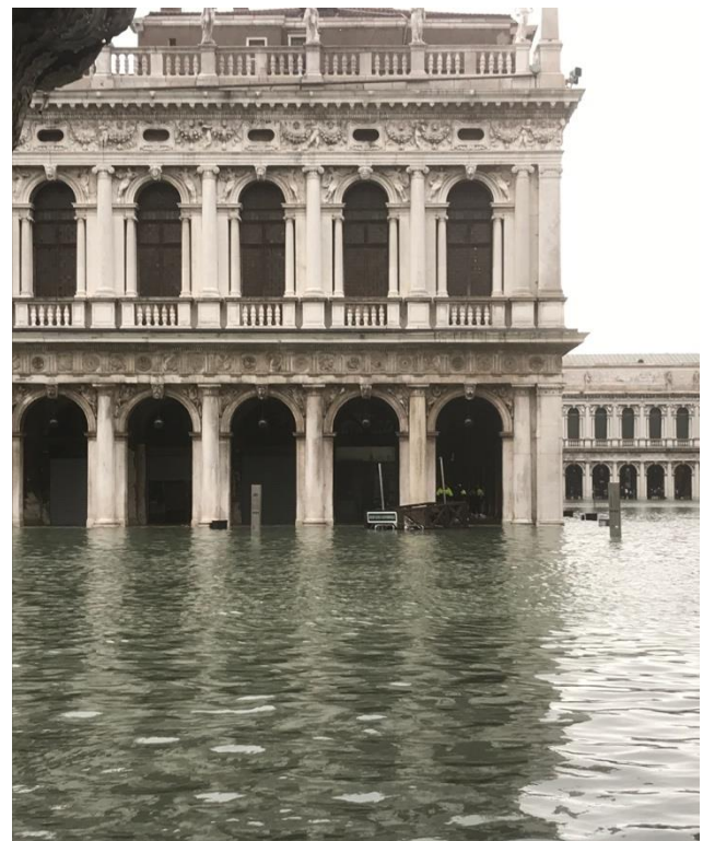
Figure 6. View of the Marciana National Library in St. Mark's Square the morning after the high water peak of November 12, 2019.

Another important question at the level of public funding concerns the support by the Italian state to private interventions, which until a few years ago did not take consider to rewarding the more conservative interventions, thus favouring inappropriate transformations (Trovò, 2010).