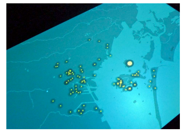
Figure 1. Projects displayed on a map of the City of Venice

Furthermore, we intentionally designed the object to create curiosity by being an interesting physical artifact to invite users to touch and utilize it. If users want to choose a facet, they tilt the object towards that area.