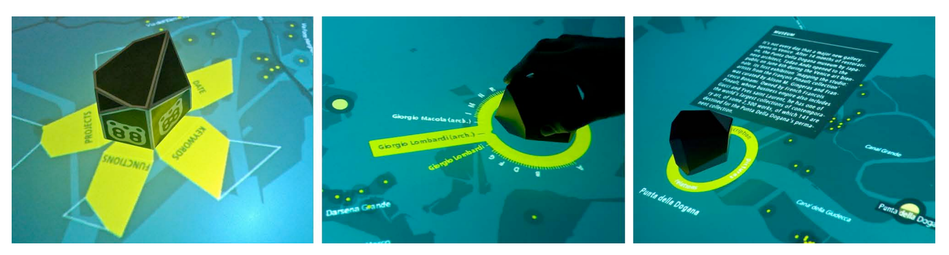
Figure 2. Interaction sequence with the tangible object, starting with a) selecting one of the facets, b) choosing a specific entry from the radial menu, and c) browsing through further metadata and media of a selected project.

it with their fingers). Tapping a marker (i.e. touching it with a single finger) selects the respective project and shows its background information and media files, as well as connections to related projects.