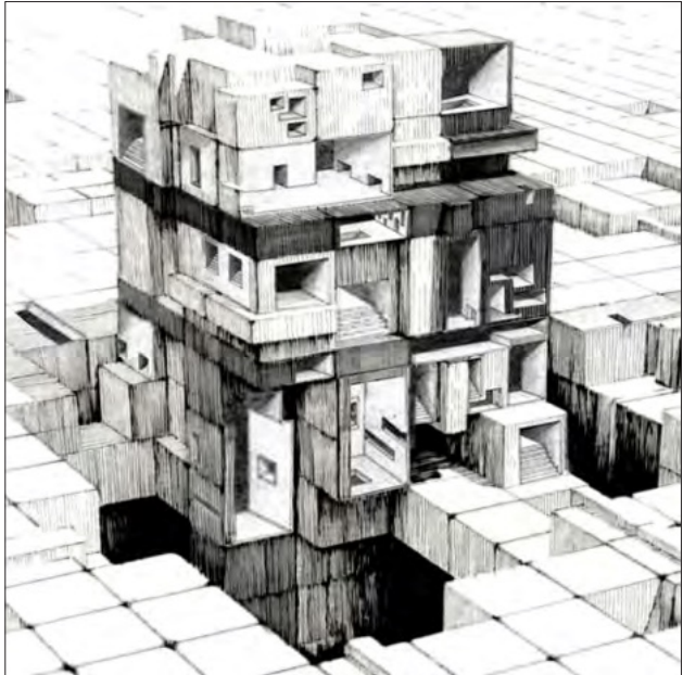
Fig. 1. BnB-COMMON. Pilot case, formulated for the assembly of a typical cell from which a series of spaces make up the shared, multiple and multiple living spaces.