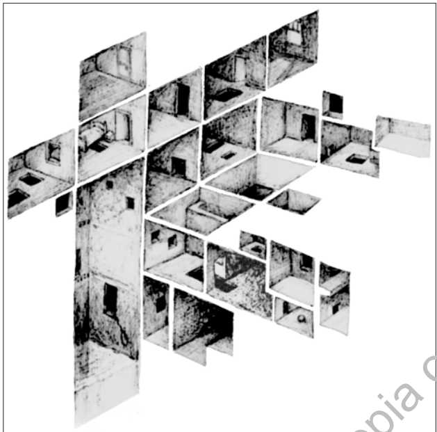
Fig. 2. BnB-COMMON. The type section of structure altered by the "bnbification" plan