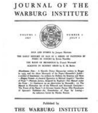
First issue of the Journal