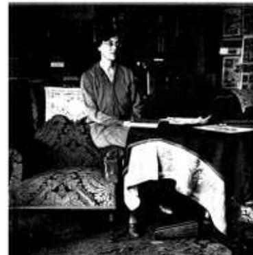
Aby Warburg's nicknames for Gertrud Bing