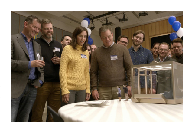
Figure 2: Alexander Payne, Downsizing, 2017. Still video

These two narratives—the shrinking body Threehorn and the miniaturization in Downsizing—provide valuable insights into the implications of body size and scale on inhabiting both physical and digital spaces. In digital environments, where the body may be represented or perceived differently, questions of scale and presence become crucial. For example, avatars in virtual worlds often grapple with issues of dimension and representation, influencing how users interact with digital spaces and with each other. The extremization of body size and scale, as explored in these stories, prompts us to consider the broader implications of physical presence on habitation. Whether through the lens of marginalization in Threehorn or the practical adjustments in Downsizing, the changing dimensions of the body reveal complex interactions between physical space, personal experience, and social dynamics. Understanding these factors can deepen our insights into how bodies inhabit and interact with various environments, both tangible and virtual.