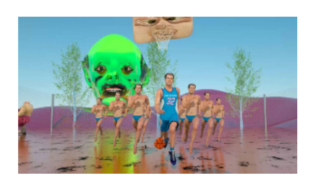
Figure 4: Cool3DWorld

The studio's work frequently juxtaposes familiar elements with unexpected ones, employing retro video game and commercial animation styles to subvert expectations and provoke critical reflection. This manipulation of scale and form underscores how digital technologies can offer novel interpretations of the body, pushing the limits of how we experience and conceptualise physicality within virtual contexts. The interplay between physical bodies and their digital representations raises important questions about how we inhabit and perceive these spaces. As Mancuso (2021) suggests, digital media not only alters our interaction with physical environments but also redefines the boundaries of bodily presence. Through their manipulation of dimensions, digital artists like those at Cool 3D World provide a lens through which we can