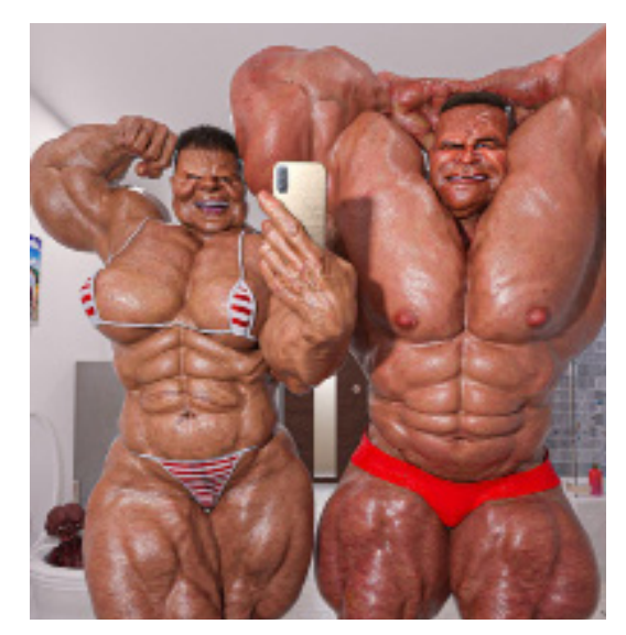
Figure 3: Cool3DWorld

The work of Cool 3D World, a multimedia studio founded by Brian Tessler and Jon Baken, provides a notable example of how digital art can engage with bodily dimensions and representations. Established in 2015, Cool 3D World employs a distinctive retro aesthetic that blends 3D modelling with unsettling yet engaging visuals (Figure 3, Figure 4). Their work frequently features distorted and exaggerated bodily forms, aligning with a broader trend in digital art that examines the boundaries between physical and digital realms. The studio's approach has been characterised as "Weird CGI," a term coined by the art historian and media expert Valentina Tanni (2020) to describe digital aesthetics that merge realistic forms with absurd and surreal content. This aesthetic creates a stark contrast between the precision of 3D modelling and the often grotesque and bizarre nature of the imagery. By manipulating dimensions and bodily forms in extreme ways, Cool 3D World challenges conventional notions of realism, prompting viewers to reconsider their understanding of the body and its representation within digital spaces.